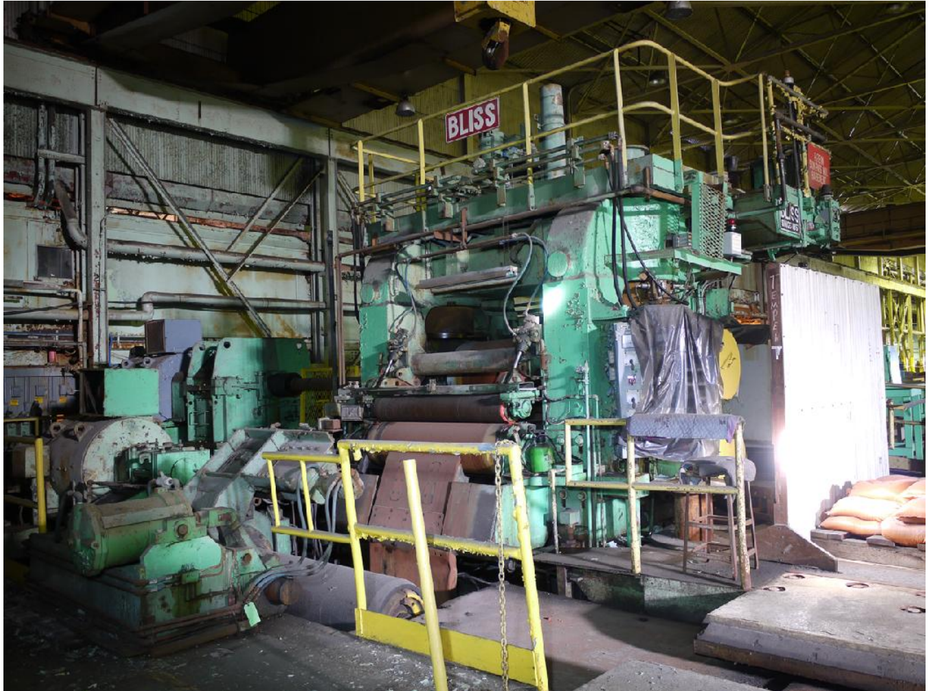
2 Hi Skin Pass/Temper Mill for Sale